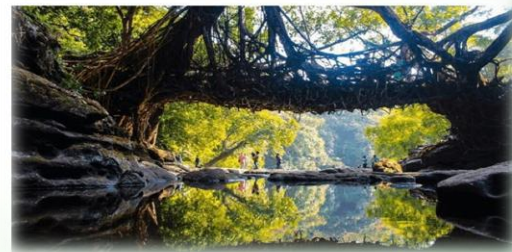
A Living Root Bridge , Meghalaya