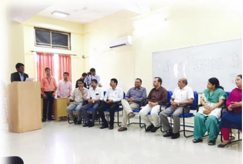
Teacher's Day Celebration at IBS