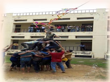
Janmashtami celebration at IUJ - "DahiHandi"