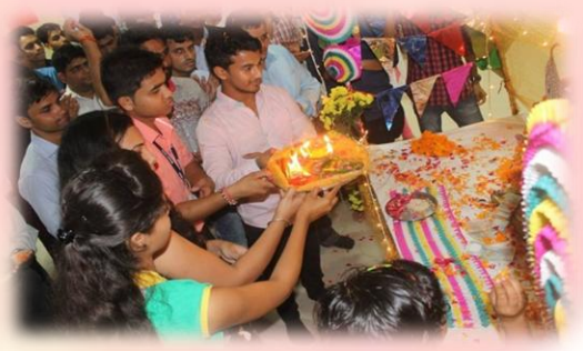
Ganpati Festival at IUJ – 3-day gala celebration