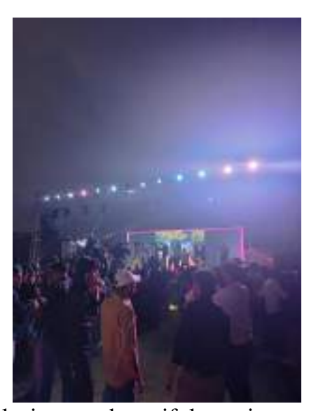
lighting, music, and festive vibes made for the perfect conclusion to a beautiful evening.

The festivities culminated in an open-air DJ party at the Football Ground. Students danced freely under the evening sky, celebrating friendship and shared memories. dinner Meanwhile, arrangements began at 6:30 PM, offering a delicious spread of options. The ambient