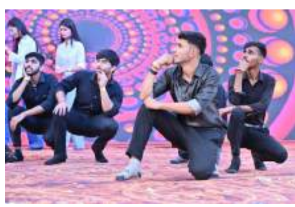
The stage lit up with dynamic dance performances: