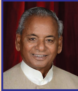
His Excellency Shri. Kalyan Singh