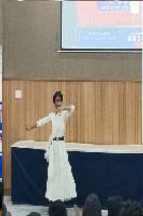
Glimpses of Day-1